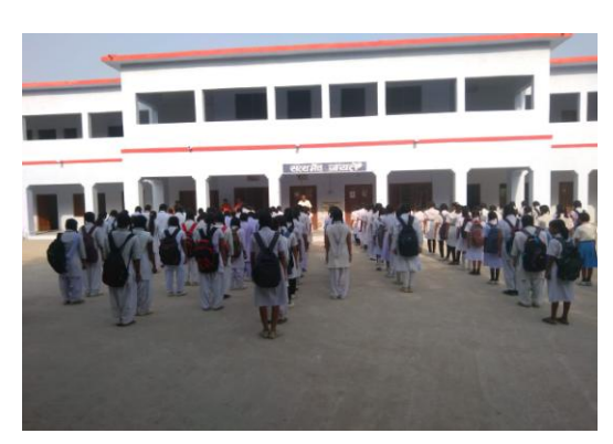
Children from Kasturba Mahila Vidyapeeth Intermediate College, Sewapuri, Varanasi take part in the commemorative programme.