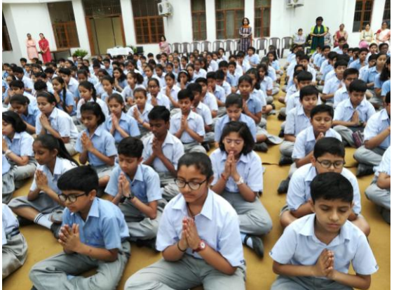
Children from Summerfields Gurugram take part in the commemorative programme. A child is seen sharing her thoughts on the tragic event on the occasion.